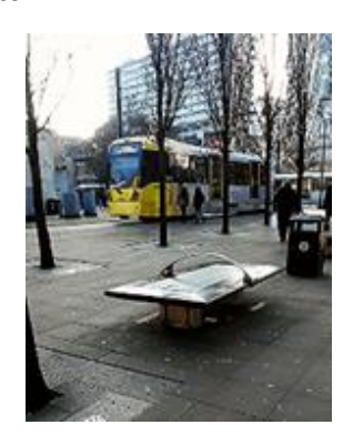
Figure 3 Photo of tram and open space consistently highly ranked

The one image that consistently appeared at the top of the diamond shape, as being most important or second most important, was a photograph of a tram and open space in Manchester City centre. The young people were asked to explain why they had ranked each of the images in the way that they had. They explained that this type of transport is 'good for the environment', 'good for old people', 'people are able to get to work if they live out of town', 'people need effective and cheap ways of getting into and around town'.