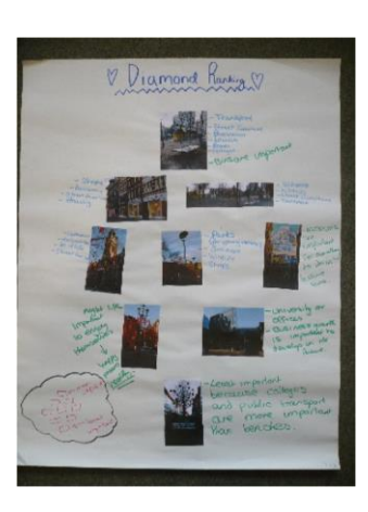
Figure 2 What makes a successful town centre?

The Diamond Ranking exercise aimed to allow the participants to consider a number of photographs showing different elements of a town or city centre. Taking nine photographs, the young people worked in groups to arrange them in order of how important they were in creating a successful town centre.