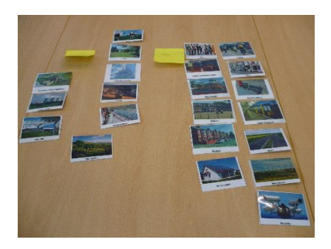
Figure 1 What is important when Planning Tyneside in 2030?

'green land', farms and parks. Other suggestions included 'big stadium football', 'shopping' and nightlife'.