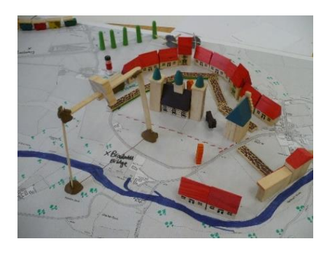
Figure 4 Creating an Eco Town

The young people were then challenged to create a model for an Eco town on a site in Northumberland, using some of the town planning principles that they had identified as being important in previous workshops.